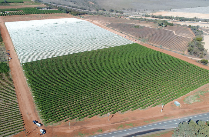
Photo Gallery - Wentworth Road, Yelta